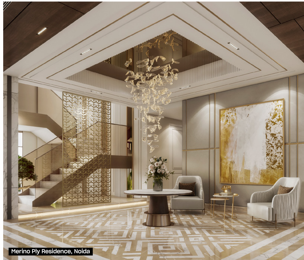
Merino Ply Residence, Noida

“ The intent, always, is to create design solutions that enable us to create unified compositions out of our furniture to harmonise modern interiors. And that’s precisely the reason why we also ventured into the furniture manufacturing segment.”