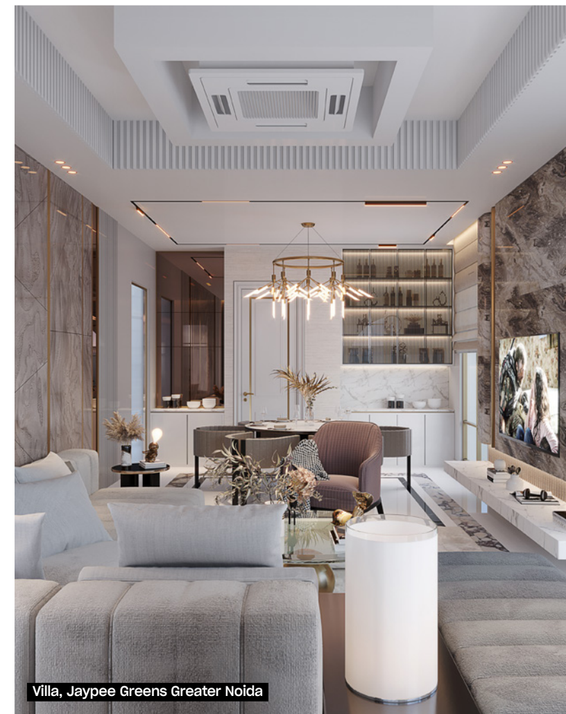
Villa, Jaypee Greens Greater Noida

cultural preferences,” she says. “Our design language inclines towards neutral, modern contemporary and new age, neo classical looks that are timeless and sophisticated. I love the details and I like how we convert and balance the classical with modern. Most of our homes our lightly classical; with modern interiors and contemporary furniture - it’s all about right balance and layering them up correctly.”