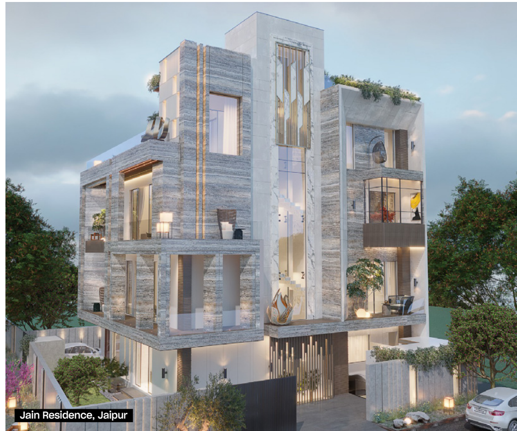
Jain Residence, Jaipur