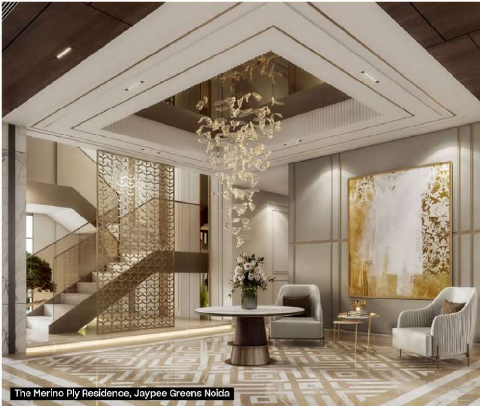
The Merino Ply Residence, Jaypee Greens Noida