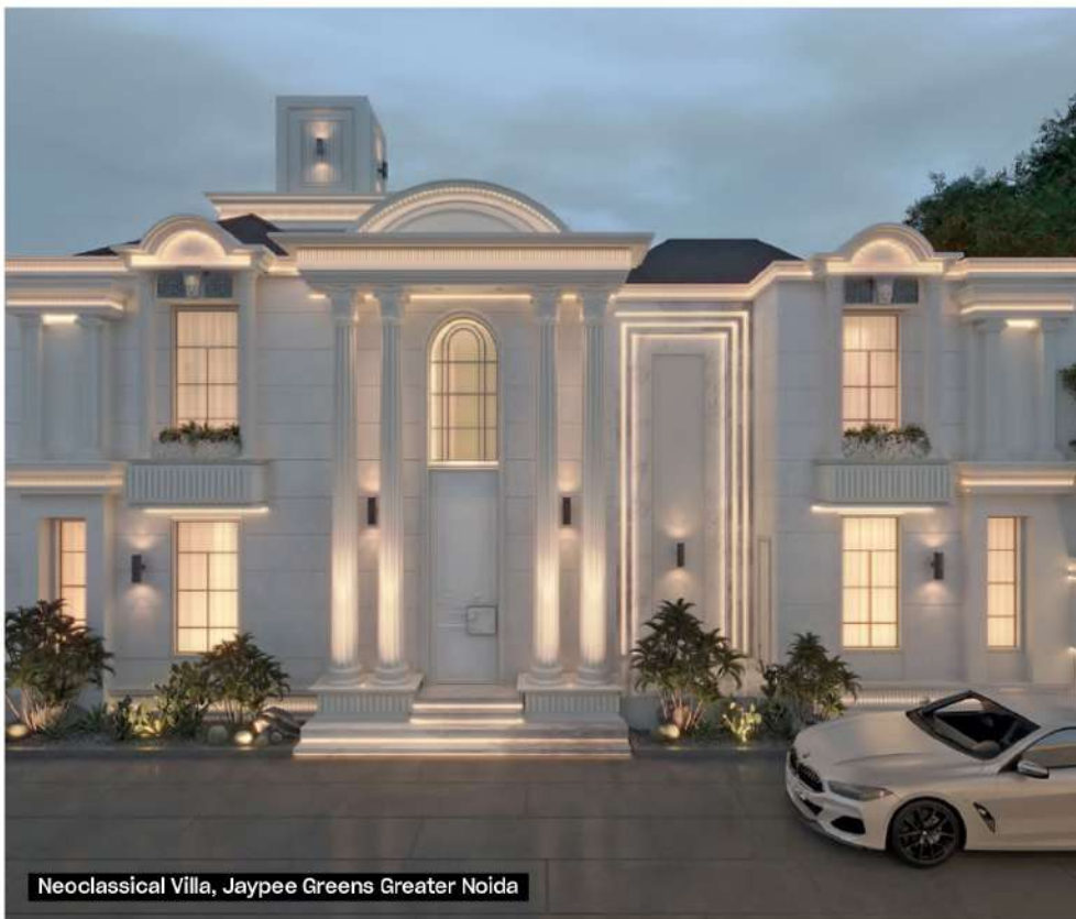
Neoclassical Villa, Jaypee Greens Greater Noida