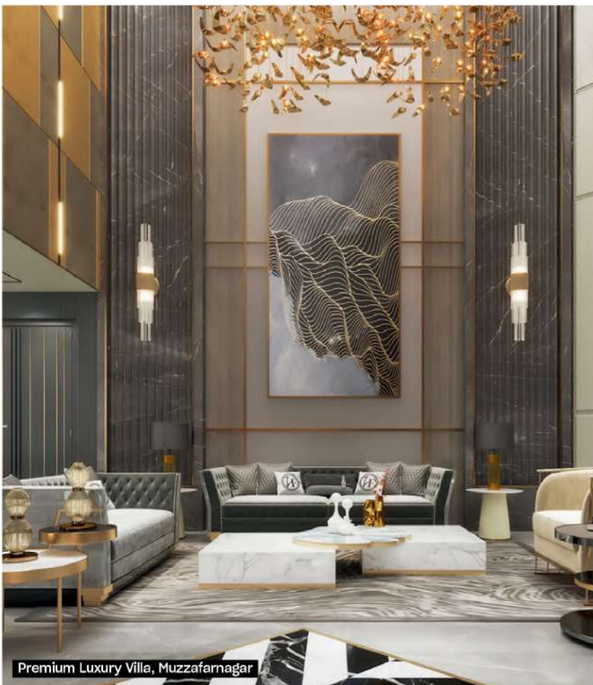
Premium Luxury Villa, Muzaffarnagar

For a residential villa in Greater Noida, Sonakshi orchestrated a gorgeous symphony — of textures, materials and scale. In true Neo Classical style, she opts for a monochromatic colour scheme and brings in the drama through accents and accessories. In this project, she experimented with finishes and textures to create sophisticated and elegant look. ✚